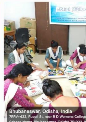
Bhubaneswar, Odisha, India 7RRV+422, Rupali St, near R D Womens College Saheed Nagar, Bhubaneswar, Odisha 751022, India