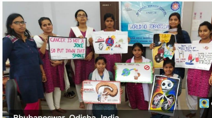
Bhubaneswar, Odisha, India