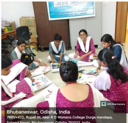
Bhubaneswar, Odisha, India 7RRV+422, Rupali St, near R D Womens College Durga mandapa, Saheed Nagar, Bhubaneswar, Odisha 751022, India