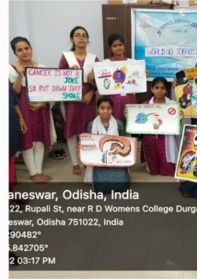
Bhubaneswar, Odisha, India 7RRV+422, Rupali St, near R D Womens College Durga Bhubaneswar, Odisha 751022, India 19.90482° 85.842705° 2022-05-28 03:17 PM