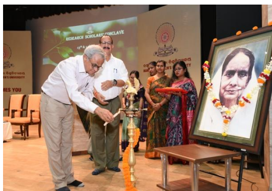
(Lighting a lamp for Maa Rama Devi)

The conclave commenced with the lighting of the lamp and a floral tribute to Maa Rama Devi.