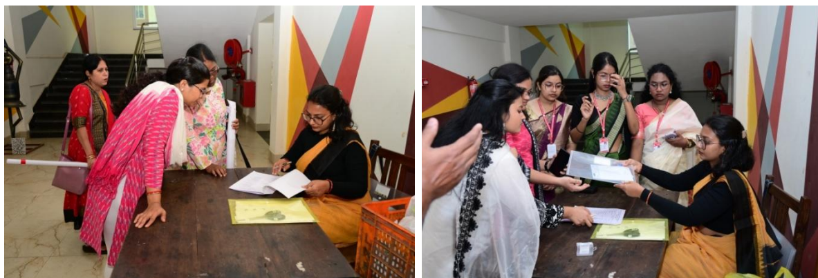
(Registration by the Research Scholars)

The Internal Quality Assurance Cell (IQAC) of Rama Devi Women's University successfully organized the Research Scholars' Conclave 2025-26 on the 13th and 14th of March, 2026. The two-day intellectual gathering was envisioned as a vibrant academic platform to foster academic dialogue, celebrate research excellence, and encourage interdisciplinary exchange among scholars. The conclave aimed to empower young researchers, elevate the quality and global visibility of the university's research output, and provide a multidimensional space for scholars to showcase both their academic and creative talents.