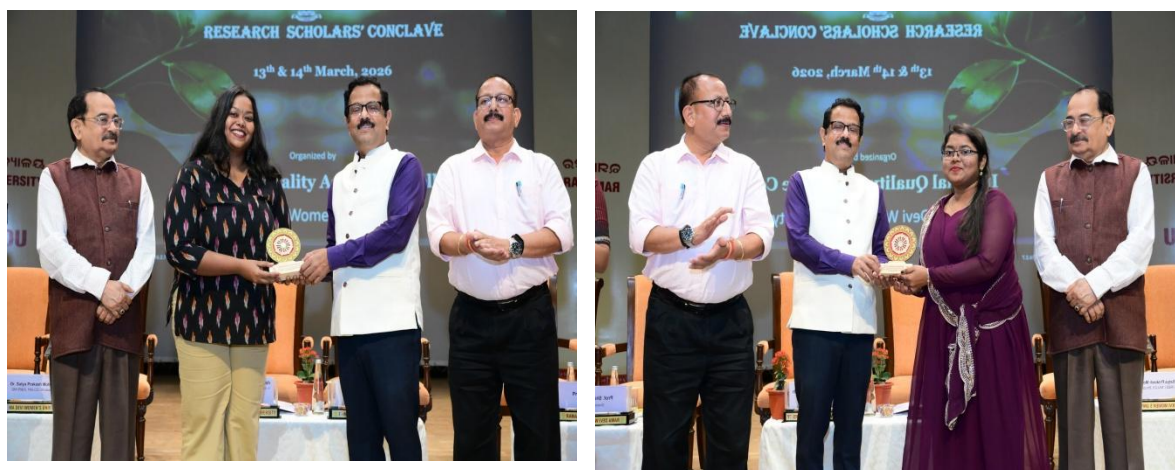
(Best poster presentation ceremony)

Best Poster Presentation Awards: Awarded to exemplary research scholars across various subjects for their innovative work and excellent presentations.