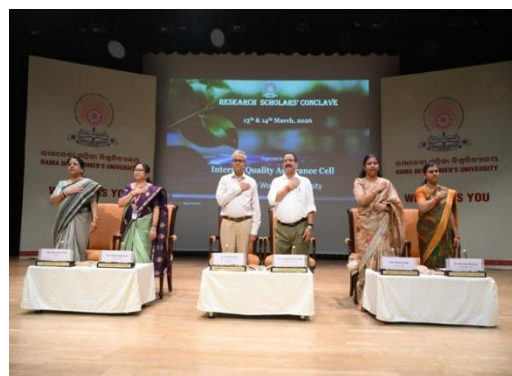
(During University theme Song)