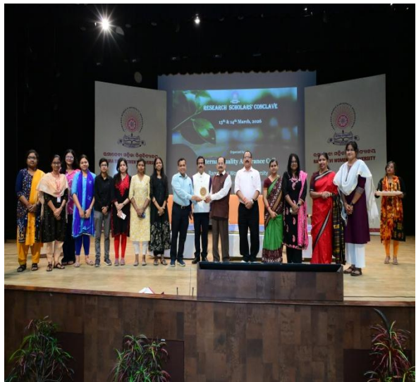
(Departmental Research Recognition Award Ceremony)