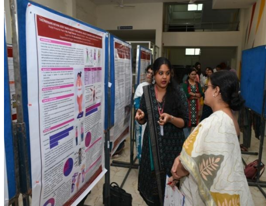
(Poster presentation by the Research Scholars)

Breaking traditional academic norms, the conclave also featured a brilliant Cultural Programme performed by the research scholars. This initiative by IQAC sought to celebrate the multidimensional talents and creativity of the researchers, reinforcing the idea that academic excellence and artistic expression can go hand in hand.