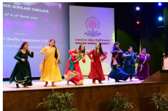
(Cultural programme performed by the Research Scholars)