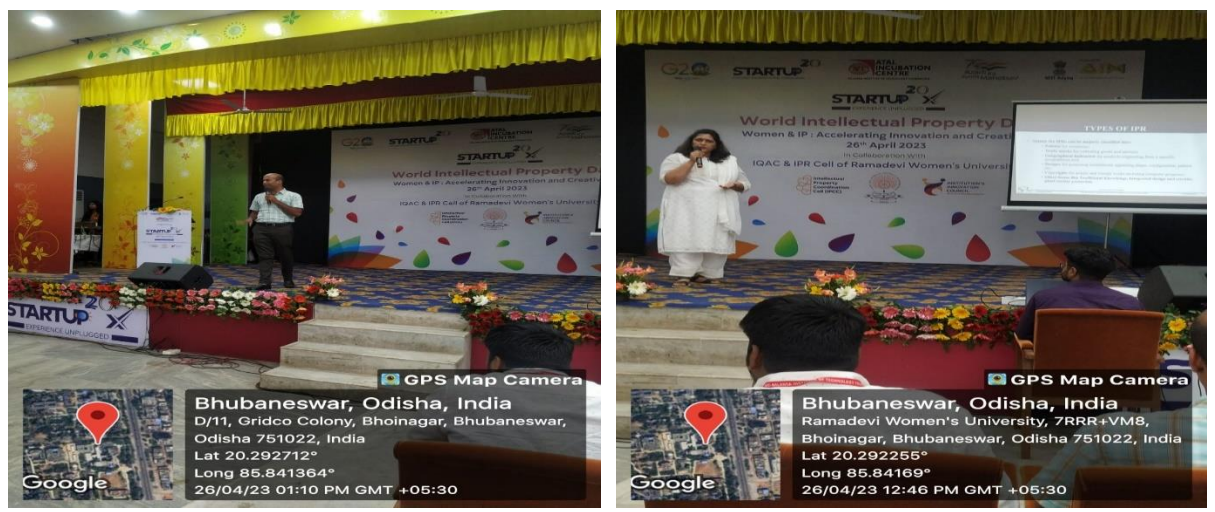
Presentation by speakers at the seminar on IP rights and regulations.