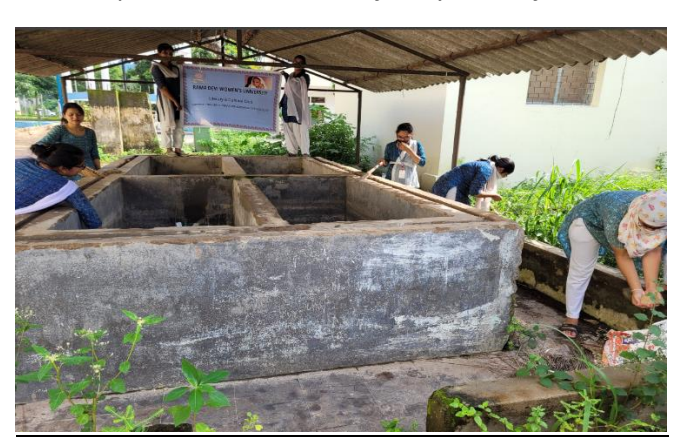
Campaign on "Awareness on Dengue"

"IF YOU WANT TO PURSUE CULTURE, YOU MUST CONTINUE TO CREATE IT."