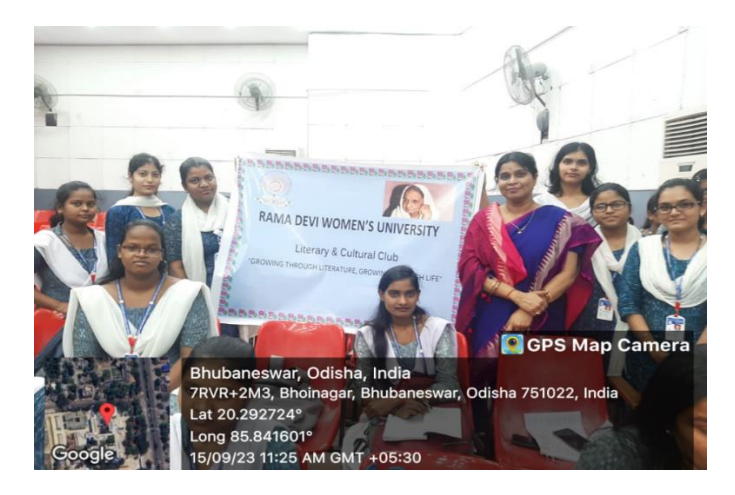
Elocution competition on occasion of Punyatithi of Maa Ramadevi

cultural club , 2023-24 is one of the majestic site to take a view upon. There's an annual planning of all competitions, workshops , awareness programs , street plays to be conducted out of which few are already done and some are in ongoing process. A successful elocution competition was held dated back to 17<sup>th</sup> July ,2023 on the topic "contribution of Maa Ramadevi in the freedom movement of India." Nearly 30 students participated in this competition. It had no language barrier. On 23<sup>rd</sup> August, 2023 on the occasion of " Punyatithi of Maa Ramadevi" many renowned dignitaries were invited to give prizes to the winners. An awareness program conducted on 16<sup>th</sup> September,2023 on the subject "Awareness on Dengue" by the student members of our literary club . In the success of all these activities there is a major role of the OIC Dr . Sanghamitra Bhanja and other respected members of the club.