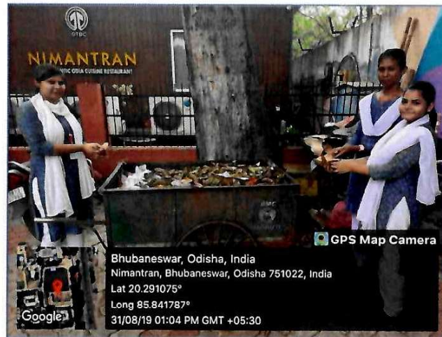
Figure 7: Photograph of students performing cleanliness drive on 31.08.2019

On August 31, 2019, the students of Rama Devi Women's University exemplified their commitment to cleanliness by organizing a community-wide cleanup initiative in the vicinity of Rupali Square.