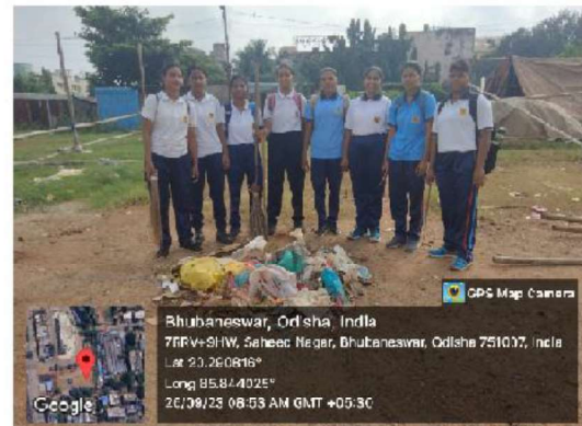
Figure 2: Photographs of Students of Rama Devi Women's University cleaning Saheed Nagar Durga Pandal on 26.09.2023