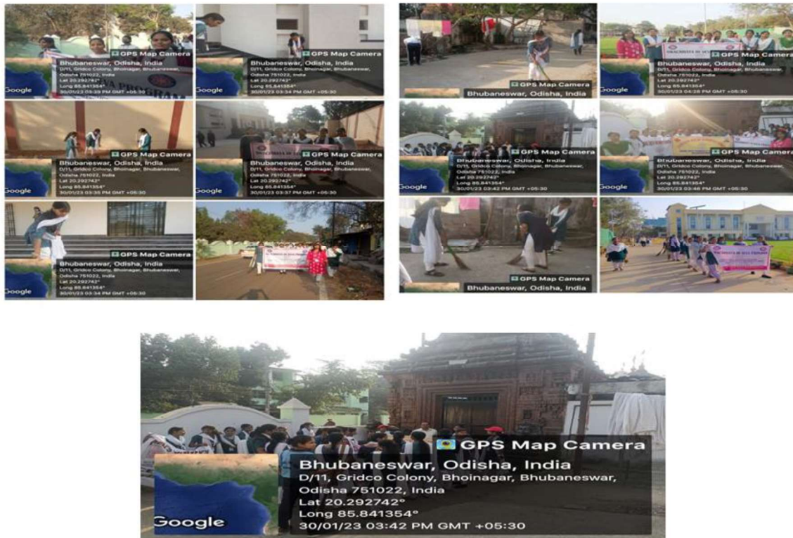
Figure 4: Photograph of students of Rama Devi Women's University Cleaning the campus of nearby Temple on 30.01.2023

NSS Volunteers from Rama Devi Women's University organized a combined campus cleaning and temple cleaning programme. This initiative involved 50 NSS Volunteers who actively participated. It focused on maintaining the cleanliness of the campus and the nearby temple premises, promoting a sense of responsibility and cleanliness among the students.