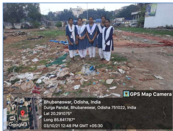
Figure 6: Photograph of students cleaning the Durga Pandal on 03.10.2021

Commemorating the birth anniversary of Mahatma Gandhi on October 2nd, the students of Rama Devi Women's University conducted a dedicated cleanliness drive on October 3rd, meticulously cleaning and restoring the Saheed Nagar Pandal. This act of reverence serves as a fitting tribute to the teachings and legacy of the Father of the Nation.