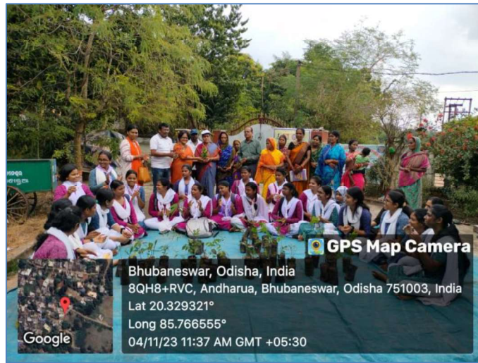
Figure 1: Photograph of plantation drive in Andharua Village

the MHRD. This initiative stands as a proud chapter in our ongoing narrative of environmental activities beyond the campus.