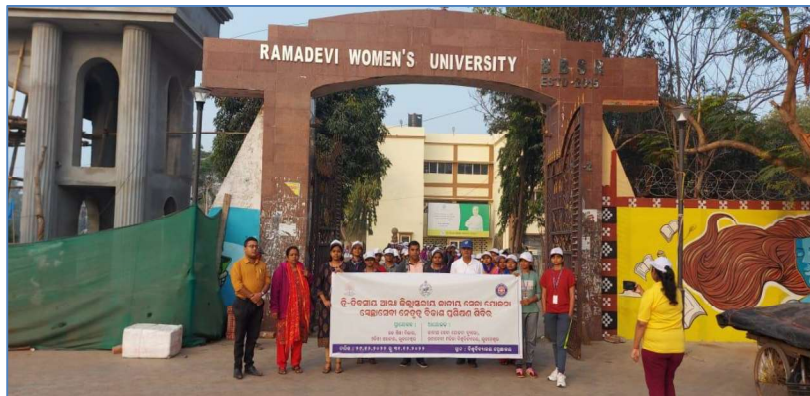
Figure 5: Photograph of Plastic Free Awareness Rally on 30.12.2022

Rama Devi Women's University conducted a Plastic Free Awareness Rally in the Unit-IX slum area. A total of 100 volunteers actively participated in this programme. The rally aimed to raise awareness about the harmful effects of plastic pollution and promote eco-friendly alternatives.