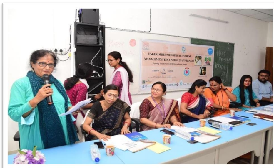
Figure No 2: Panel members of the consultancy workshop entitled Engendered Menstrual Hygiene Management Education and Awareness (Fostering Transformation with Diverse Gender Group) held on Friday 27th May 2022