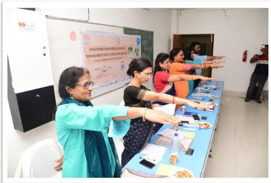
Figure No 3 & 4: Oath taking ceremony by the participants in the consultancy workshop entitled Engendered Menstrual Hygiene Management Education and Awareness (Fostering Transformation with Diverse Gender Group) held on Friday 27th May 2022. We Are Committed- Making menstruation a normal fact of the life held.