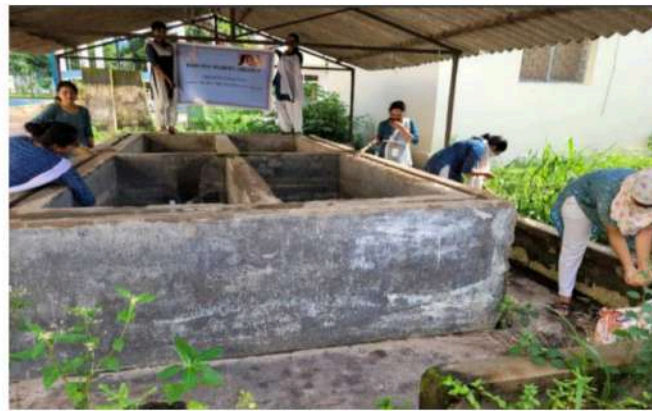
Campaign on "Awareness on Dengue"

" IF YOU WANT TO PURSUE CULTURE, YOU MUST CONTINUE TO CREATE IT."