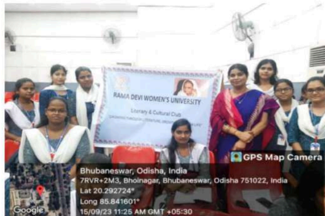
Elocution competition on occasion of Punyatithi of Maa Ramadevi

and cultural club , 2023-24 is one of the majestic site to take a view upon. There's an annual planning of all competitions, workshops , awareness programs , street plays to be conducted out of which few are already done and some are in ongoing process. A successful elocution competition was held dated back to 17 th July ,2023 on the topic "contribution of Maa Ramadevi in the freedom movement of India." Nearly 30 students participated in this competition. It had no language barrier. On 23 rd August, 2023 on the occasion of " Punyatithi of Maa Ramadevi" many renowned dignitaries were invited to give prizes to the winners. An awareness program conducted on 16 th September,2023 on the subject "Awareness on Dengue" by the student members of our literary club . In the success of all these activities there is a major role of the OIC Dr . Sanghamitra Bhanja and other respected members of the club.