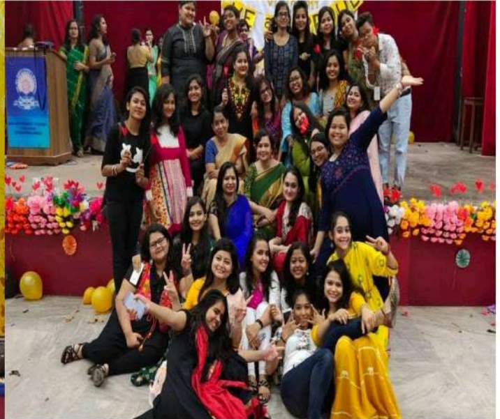
Farewell programme of the undergraduate students of the Department of English, Rama Devi Women's University