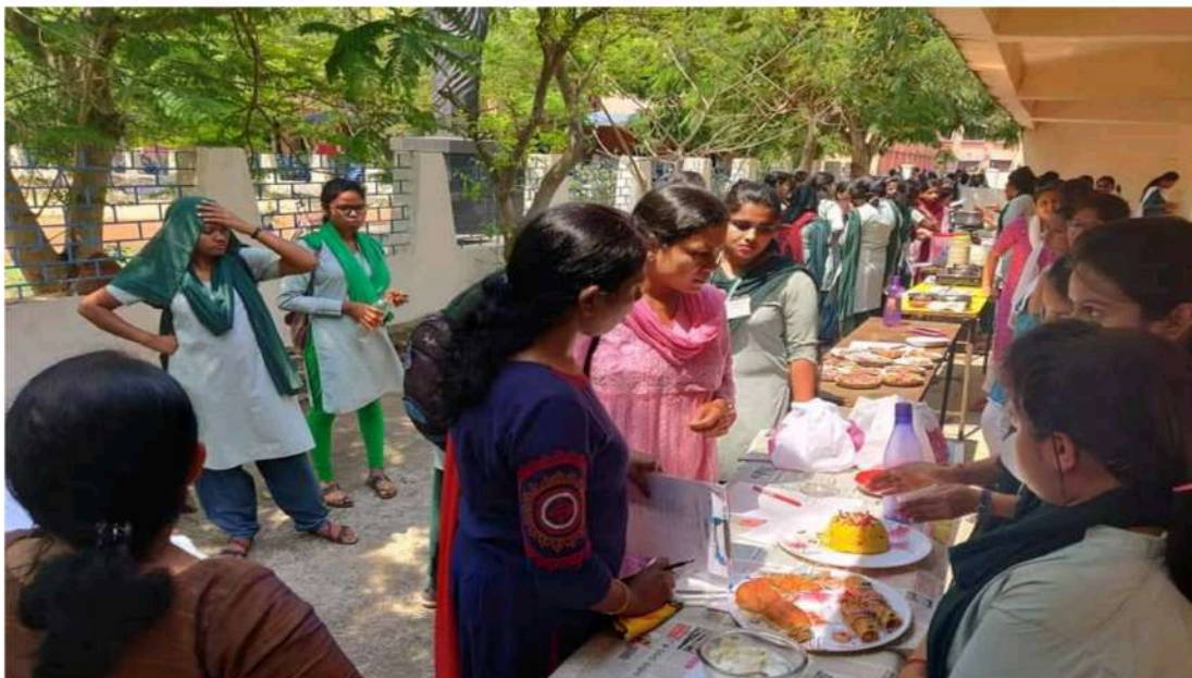
Food Fest by students of Rama Devi Women's University held in the campus premises