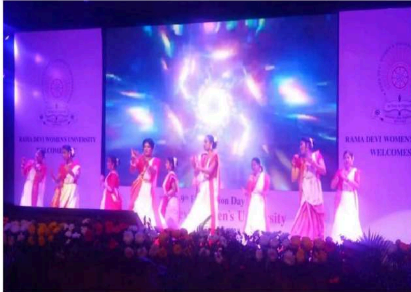
Bengali Dance performance by the students at the Foundation Day of Rama Devi Women's University