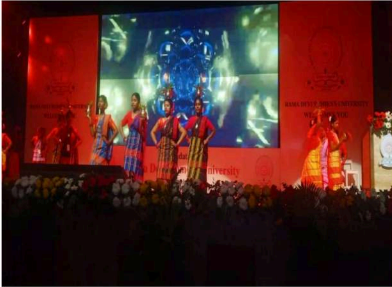
Tribal dance by the students of Rama Devi Women's University