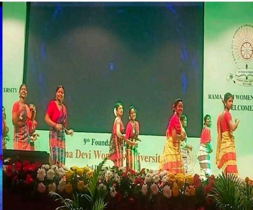
Santali Dance by the students at the 9th Foundation Day of Rama Devi Women's University