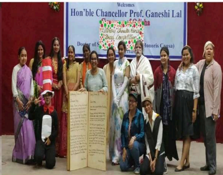
Students dressed up as literary characters in the Literary Character Fancy Dress Competition held at Rama Devi Women's University