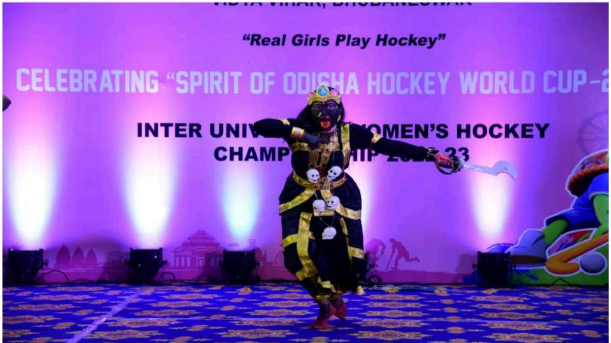
Kali Dance performance during the Inter-University Women's Hockey Championship held at Rama Devi Women's University