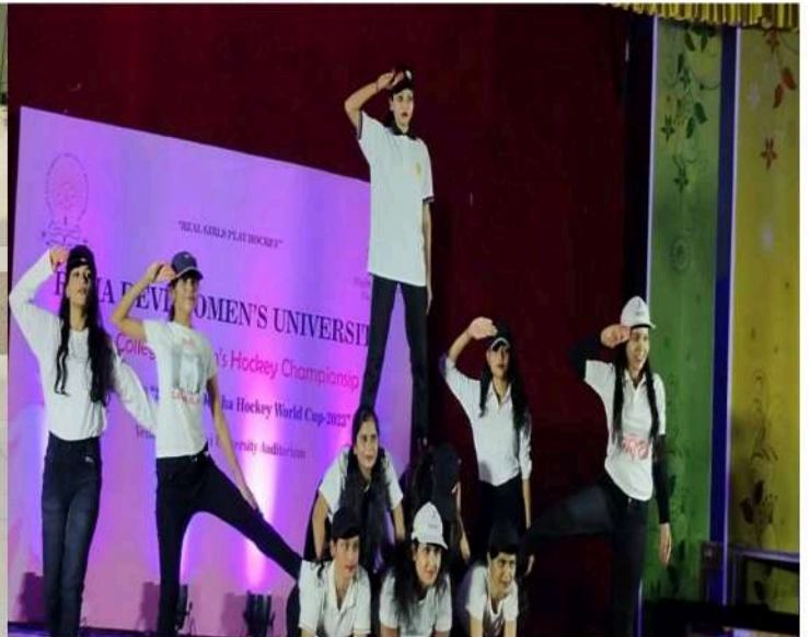
Patriotic Dance performance at the Inter-University Hockey Championship at Rama Devi Women's University