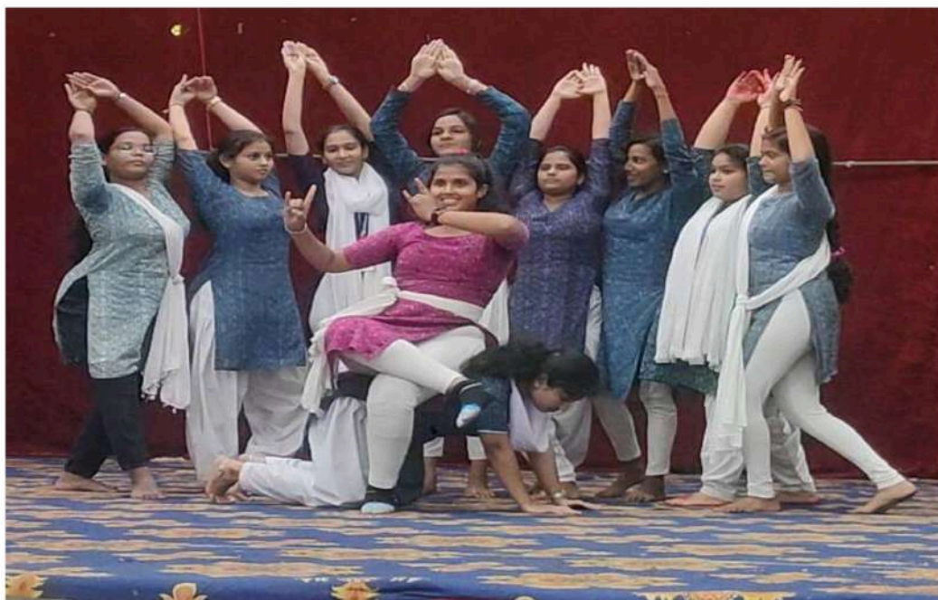
Krishna-Leela Kalia Dahan dance performance by the students of Rama Devi Women's University