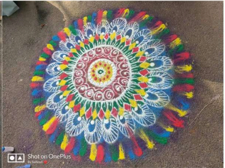
Rangoli (above and below left) and Jhoti designs (below right) made by students at the Rangoli-making and Jhoti-making competitions held in Rama Devi Women's University