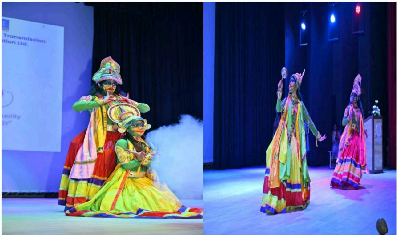
Kathakali dance performance by students of Rama Devi Women's University