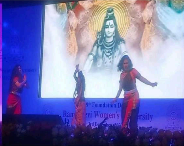
Shiv Tandav performance by the students of Rama Devi Women's University