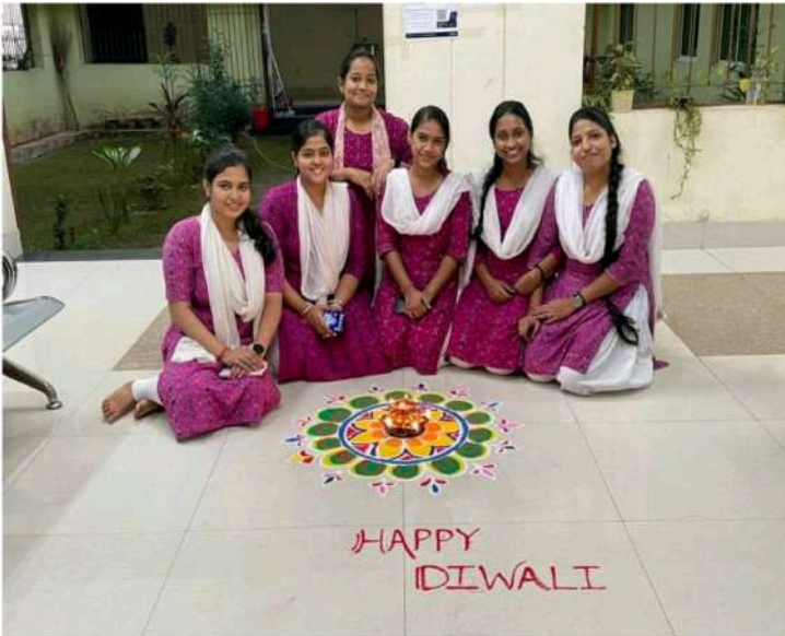
Diwali Celebration of students at Rama Devi Women's University