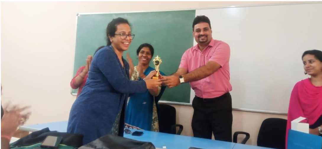
Felicitation of best departmental performer in the training programme