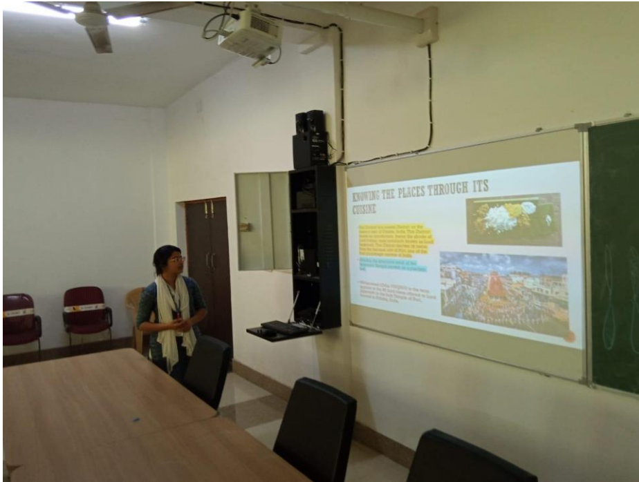
Trainee making her physical presentation for boosting self confidence under the 3 rd component of the training programme