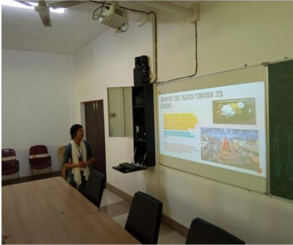
Trainee making her physical presentation for boosting self confidence under the 3 rd component of the training programme