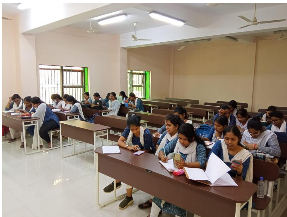
An ongoing group discussion session on language and communication under the skill training programme