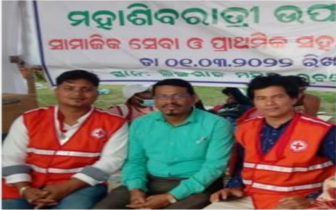
Social Service at Lingaraj Temple.