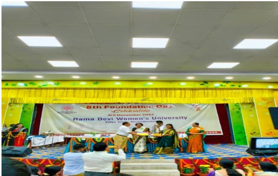
The students won prizes on the eve 8 th Foundation Day of Rama Devi Women's University in debate competition.