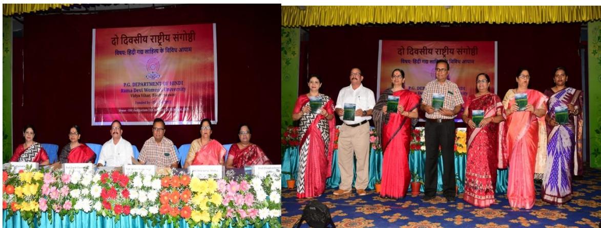
Two days National Seminar on "Hindi Gadya Sahitya ke Vividh Aayam" organized by Dept. of Hindi, RDWU on 25th & 26th August 2023.