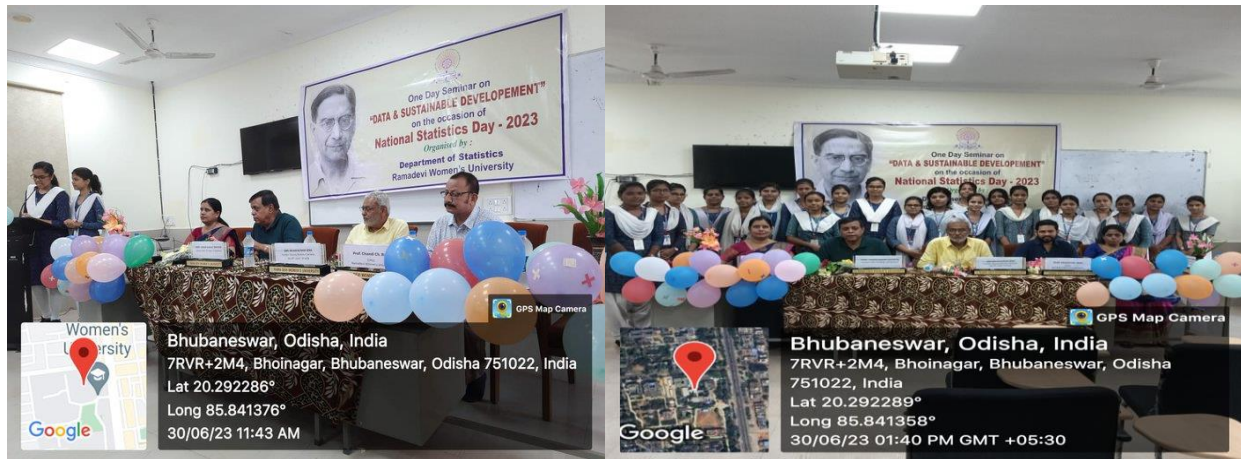
One day seminar on " Data and Sustainable Development" has been organized by the Dept. of Statistics, Rama Devi Women's University on the occasion of National Statistics Day.