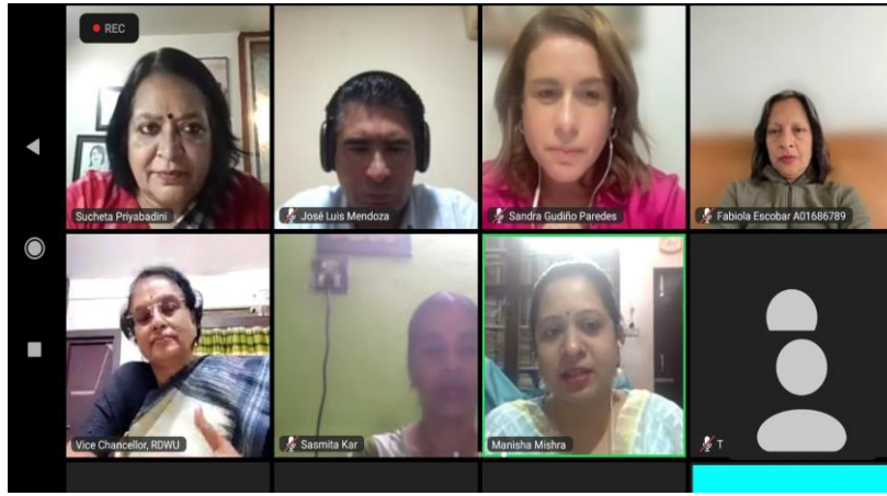
International webinar on "Educational and Cultural similarities and differences between India and Mexico". There was a discussion and exchange of ideas between faculty and students of Tecnológico de Monterrey University, Mexico and Rama Devi Women's University 18.09.2023.