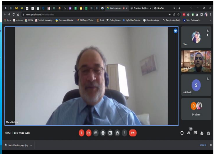
Dept. of Life Sciences, Rama Devi Women's University, organised two days online International Webinar on "Microplastic Pollution: Adversities and Strategies" on 27th & 28th April 2023.