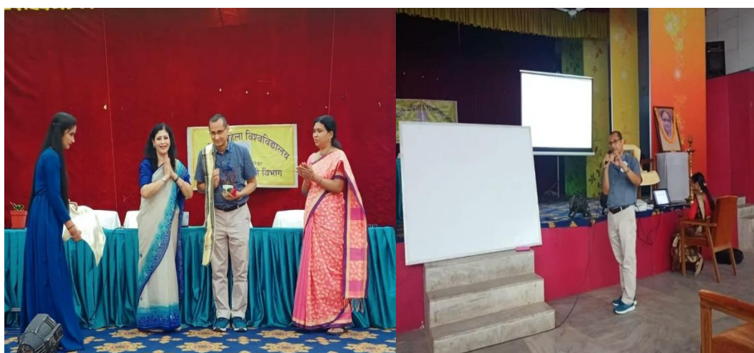
One day Seminar on Computational Linguistics was organised by Dept. of Hindi, RDWU.