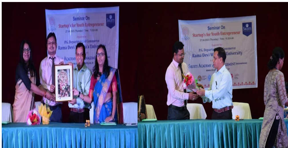
Seminar on "#Start-ups for Youth Entrepreneurs" was organised by P.G. Department of #Commerce, Rama Devi Women's University in association with Srusti Academy of Management on 27/4/2023.