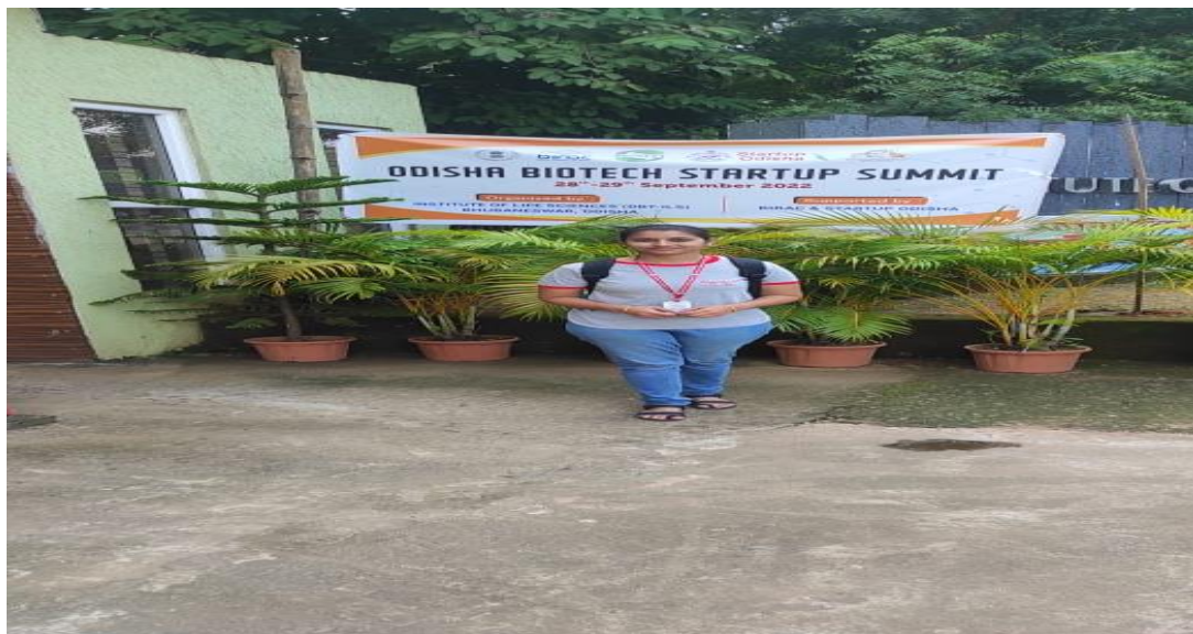
Research scholar of Life Sciences at the Start Up summit