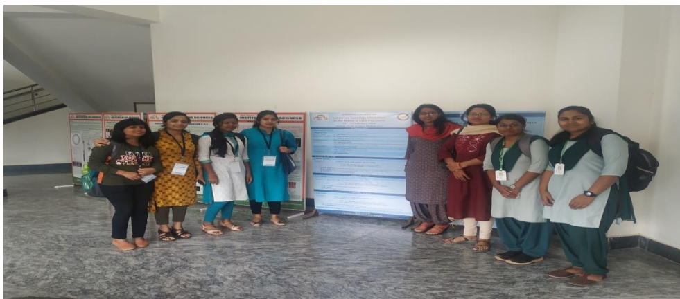
Students along with faculty members at the event