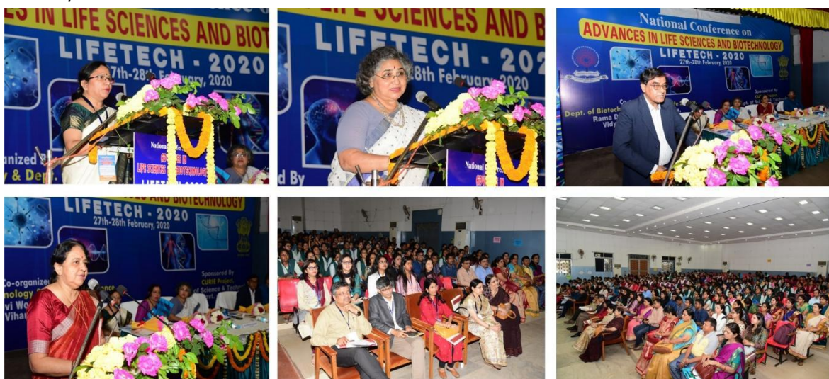
Talk by Convenor, Guest of Honour, Chief Guest and Patron of LifeTeach-2020 Conference