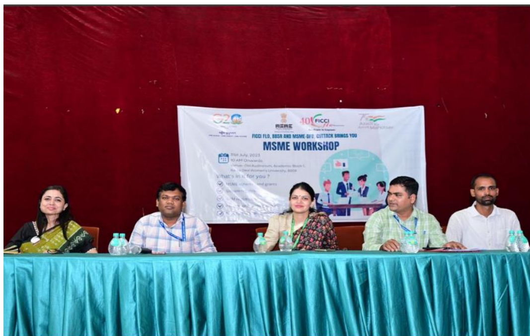
Resource person attending the MSME workshop

FLO Bhubaneswar in association with MSME-DFO Cuttack organized a MSME workshop on 31.07.2023 at Rama Devi Women's University, Bhubaneswar. The main objective of the workshop was to sensitize the students and create awareness about onboarding of new businesses under MSME, schemes and incentives, GeM portal onboarding etc. Also, the workshop focused on creating awareness about credit facilities, reimbursements of trade fairs, trademark reimbursement, and access to national & international trades. A total of 67 students participated in the programme.