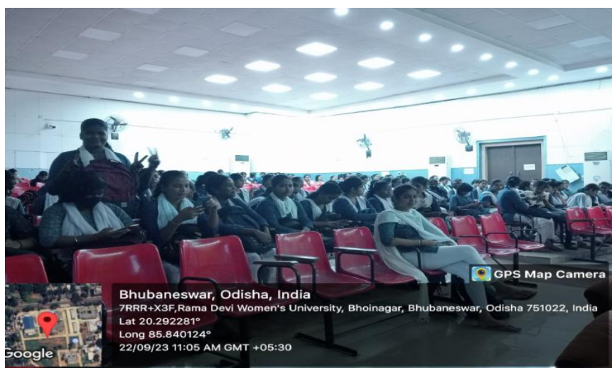
Students participate during the post workshop questionnaire