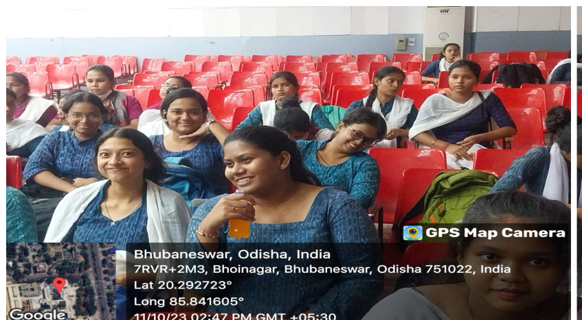
Student participants at the event