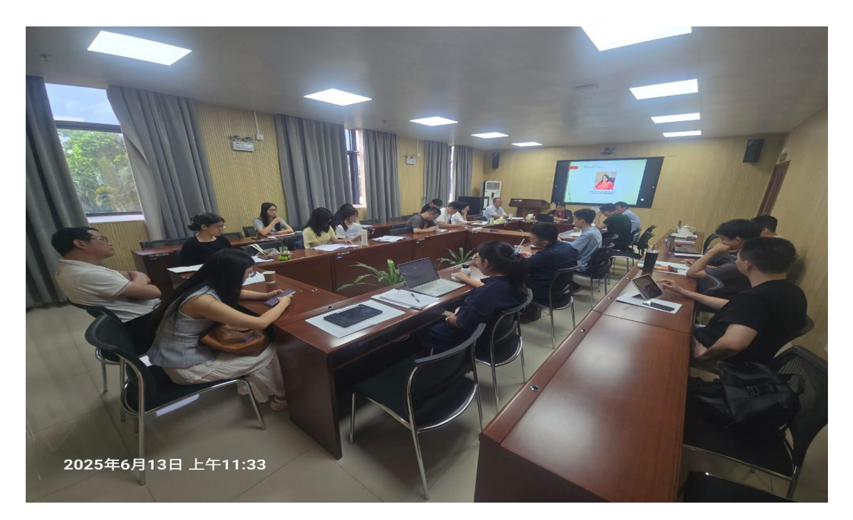
Sun Yat Sen university 13.6.25