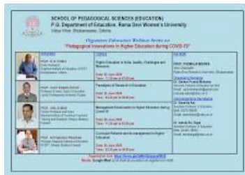
WEBINAR BROCHURE 23 06 2020-page0001 (1).jpg 891K