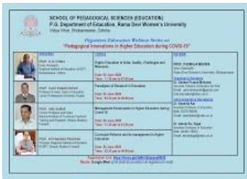
WEBINAR BROCHURE 23 06 2020-page0001 (1).jpg 891K