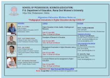
WEBINAR BROCHURE 23 06 2020-page0001 (1).jpg 891K