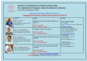
WEBINAR BROCHURE 23 06 2020-page0001 (1).jpg 891K