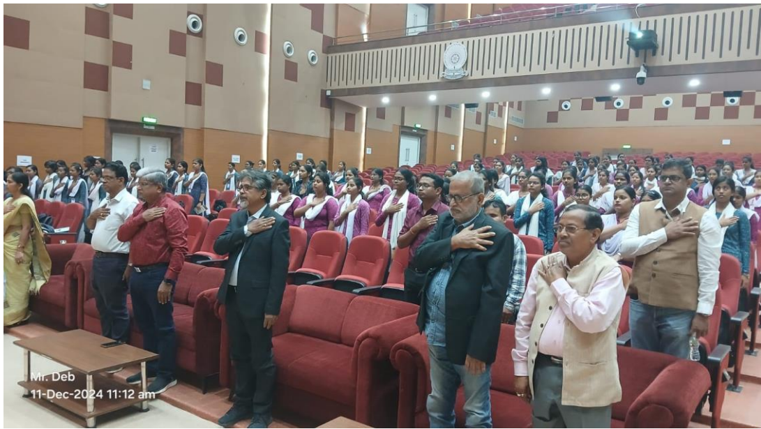
Audience at the Curtain raiser event of 15 th Odisha Environment Congress