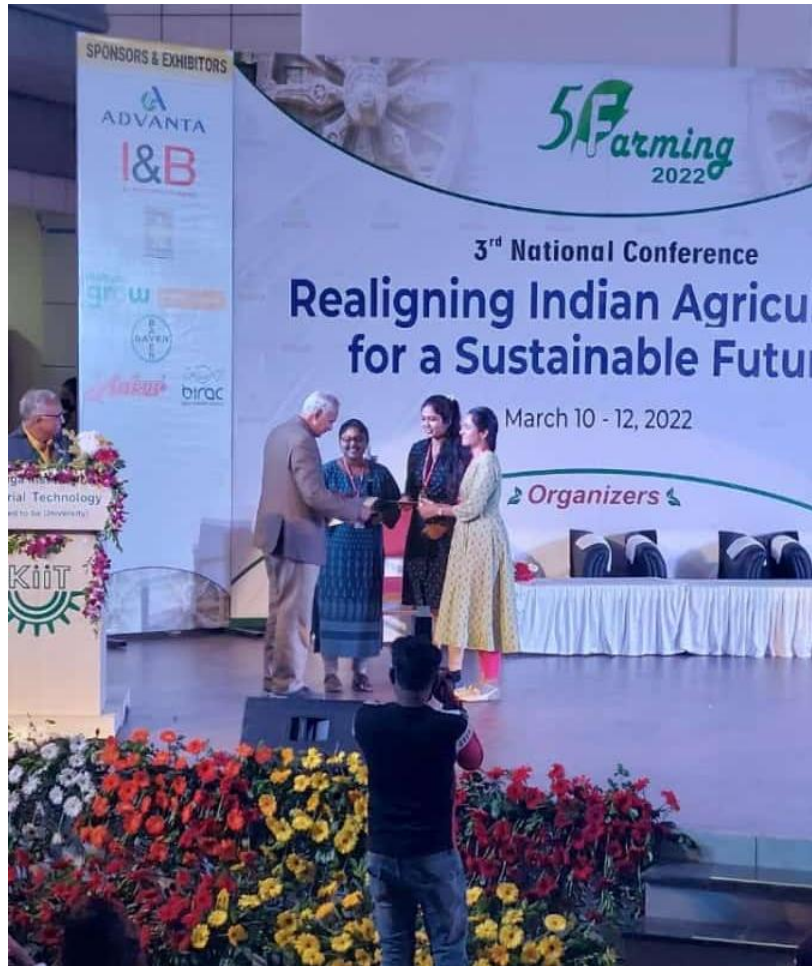
Team Rama Devi Women's University won the third prize in the Agri-Quiz event held during "5F Farming 2022"