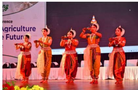
Agri-quiz session (on left), cultural performance (on right)