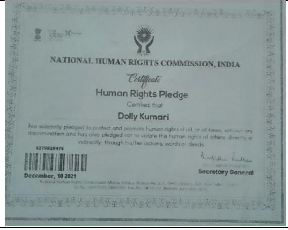
Participated in Human Rights Pledge Name: Dolly Kumari