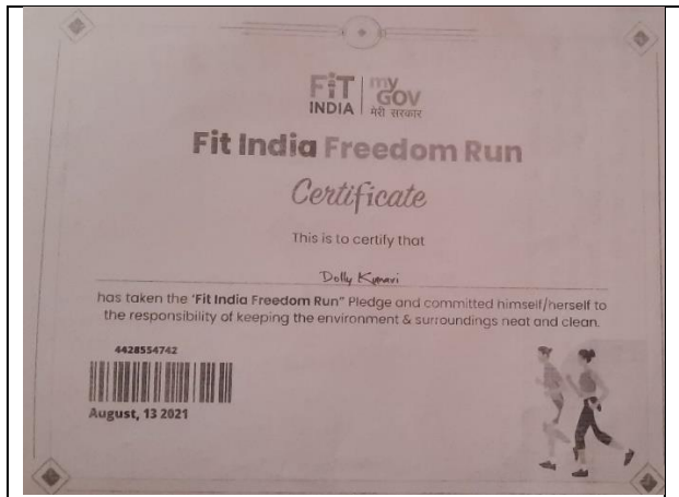
Participated in Fit India Freedom Run Pledge Name: Dolly Kumari