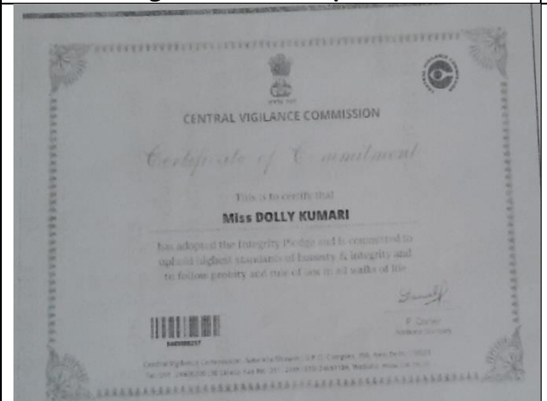
Participated in Integrity Pledge Name: Dolly Kumari