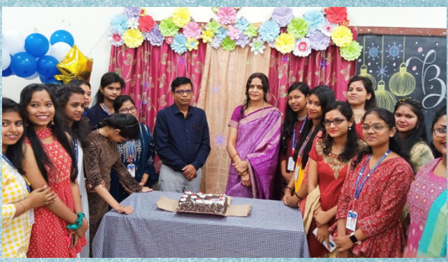
Welcome of the 2022-25 batch