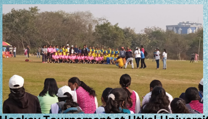
Hockey Tournament at Utkal University