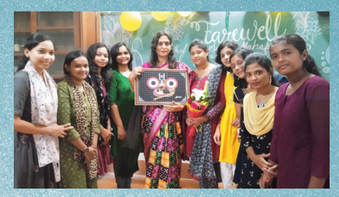
Farewell to H.O.D Madam