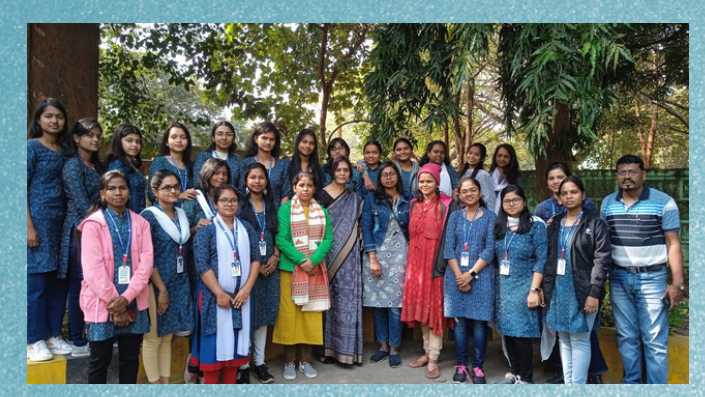
Study tour to Ansupa