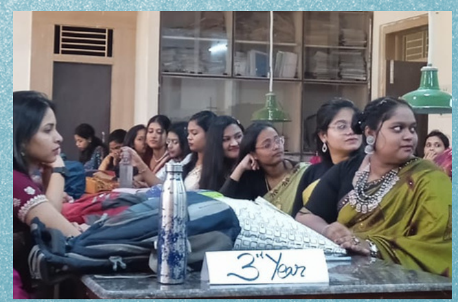
Farewell to the 2020-23 batch