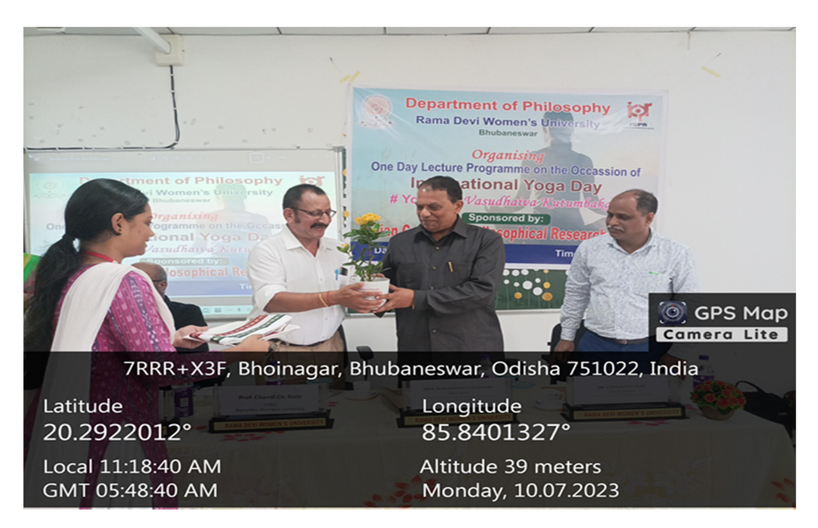
The Resource Person felicitating CPGC Sir