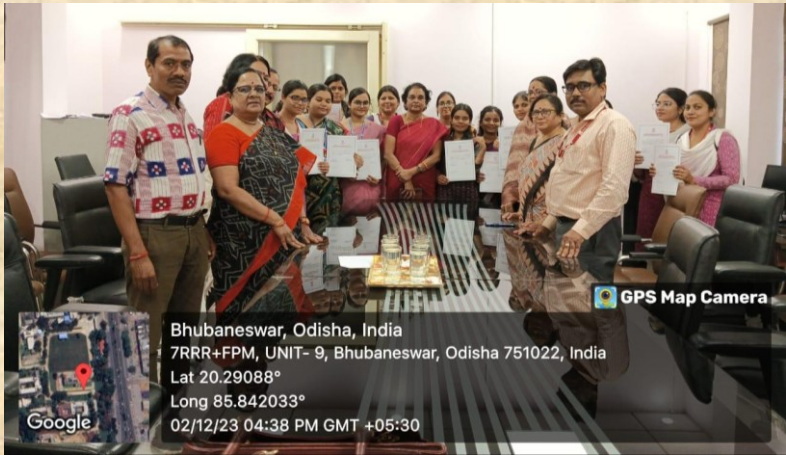
Students receiving certificates for the disability studies