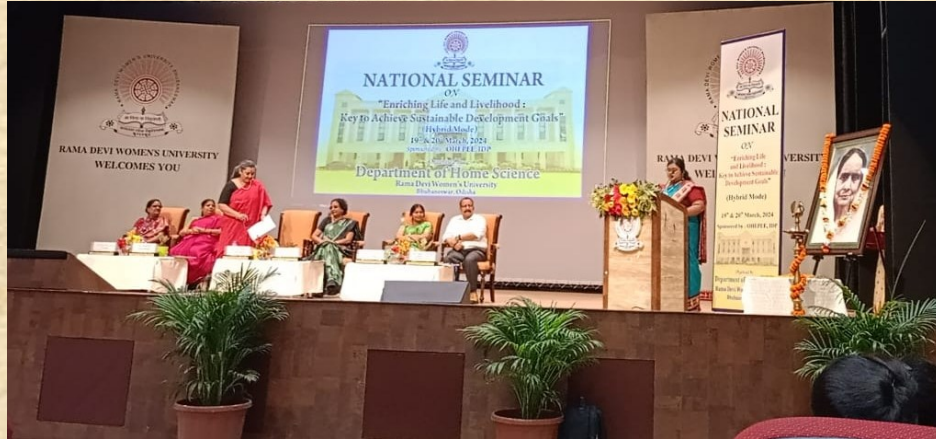
Dignitaries of the Dias