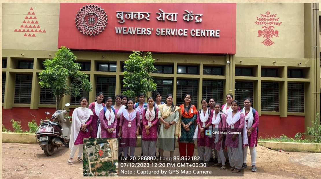
Visit to Weaver's Service Centre