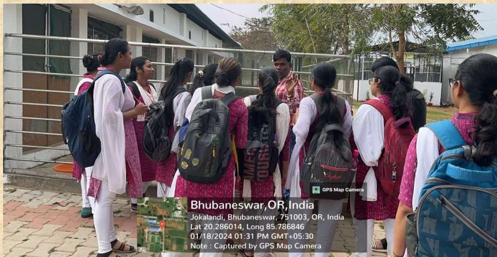
Demonstrations and Tutorials by Experts at ICAR CIWA