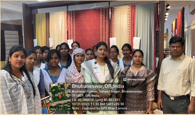
UG, PG Students and Faculty Members of Home Science Department at Weaver's Service Centre