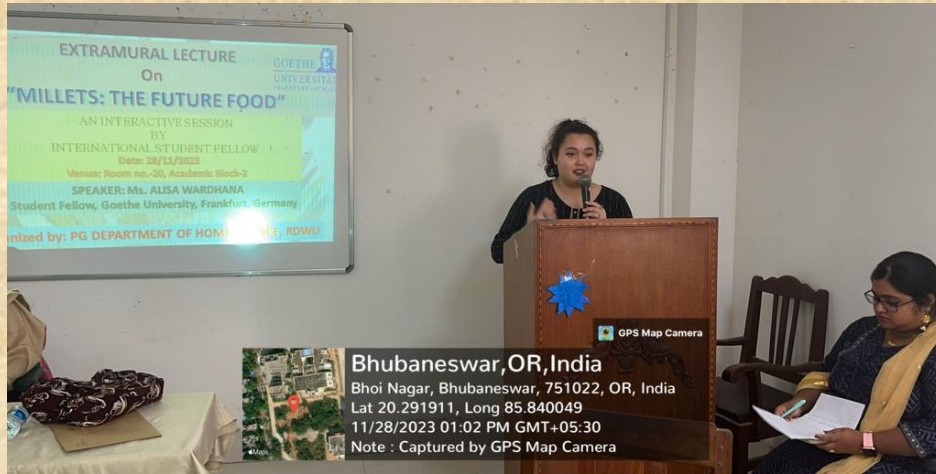
Address by the German Student