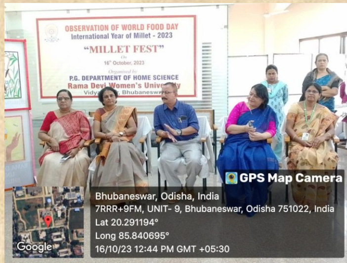
Judges of Millet Fest Competition