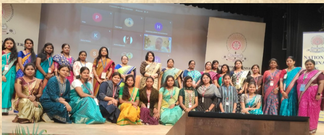
Students and Guests at the National Seminar