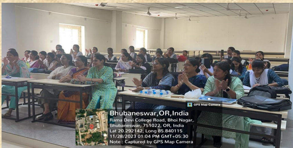
Students and Faculties of Home Science attending the Lecture