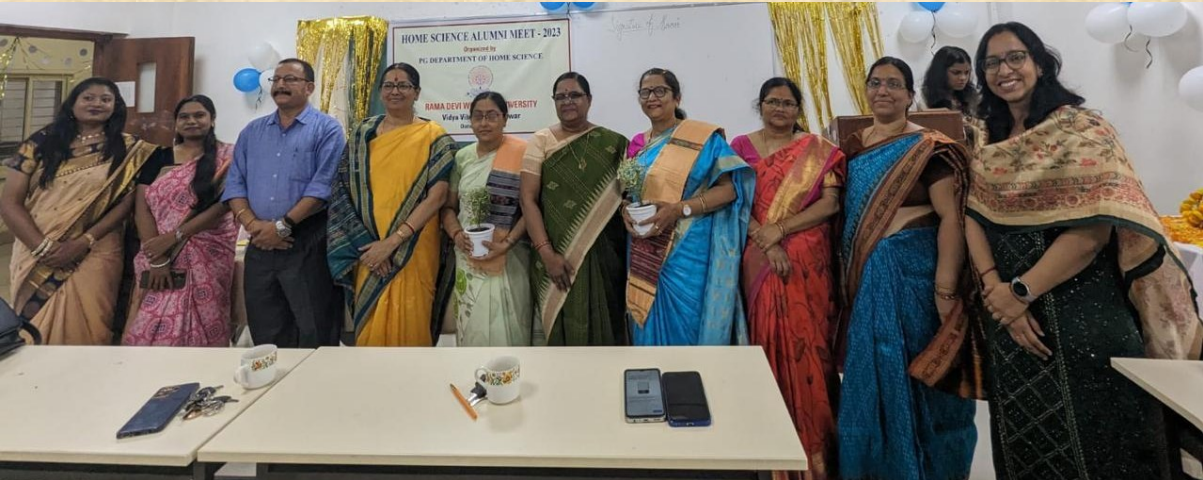
Felicitations of the Guests