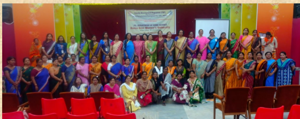
Participants of Faculty Development Programme