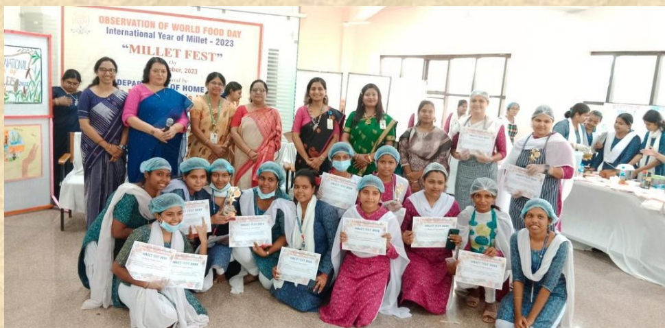
Winners of Millet Fest Competition