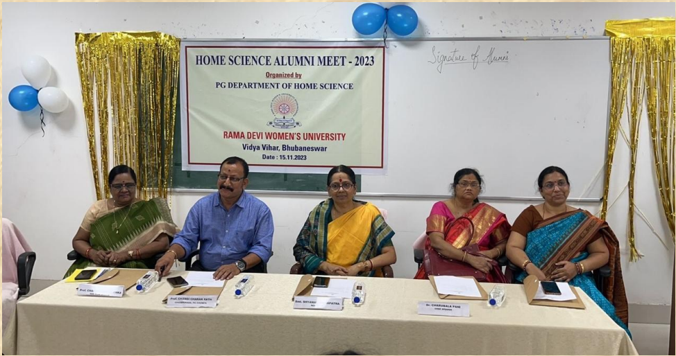
Dignitaries of the Dias