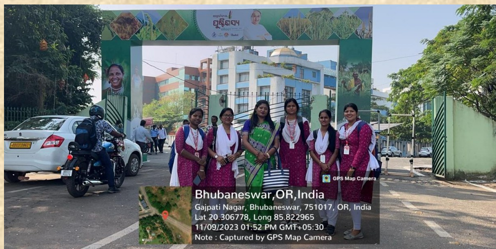
Students and Faculties of Home Science Department at "International Convention on Millets"