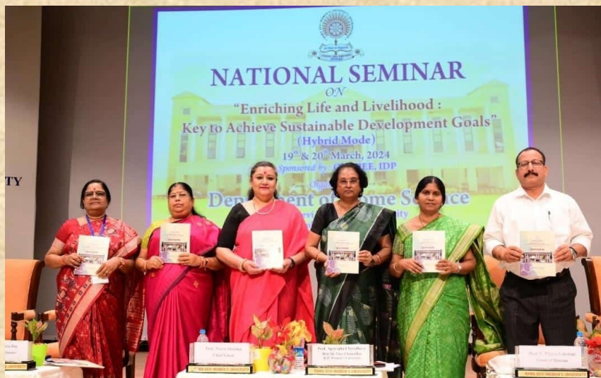
Release of Souvenir