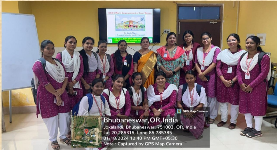
Students and Faculties of Home Science Department at ICAR CIWA