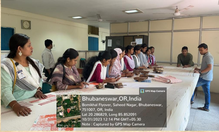
Demonstrations and Tutorials by Experts at the Weaver's Service Centre