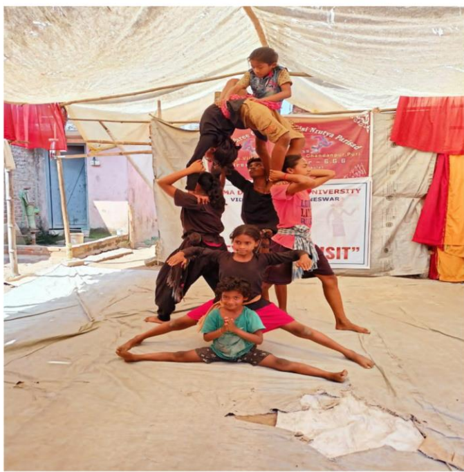
Figure 10 & 11: Students also exposed to the Gotipua nacha and the story behind the folk dance at Raghurajpur, Odisha on 15th March 2022.

We got to know about the traditional process of making Pattachitra and also got to see beautiful idols made of wood and stone carvings. At last, we got the opportunity to witness Gotipua dance. It was such a heavenly and overwhelming experience. The visit to Raghurajpur was