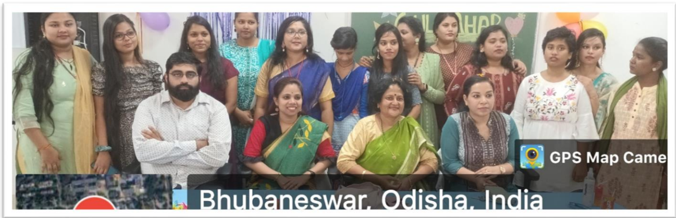
Figure 21: 5 September 2022, Calibration of teacher's day with lots of performances by the students.