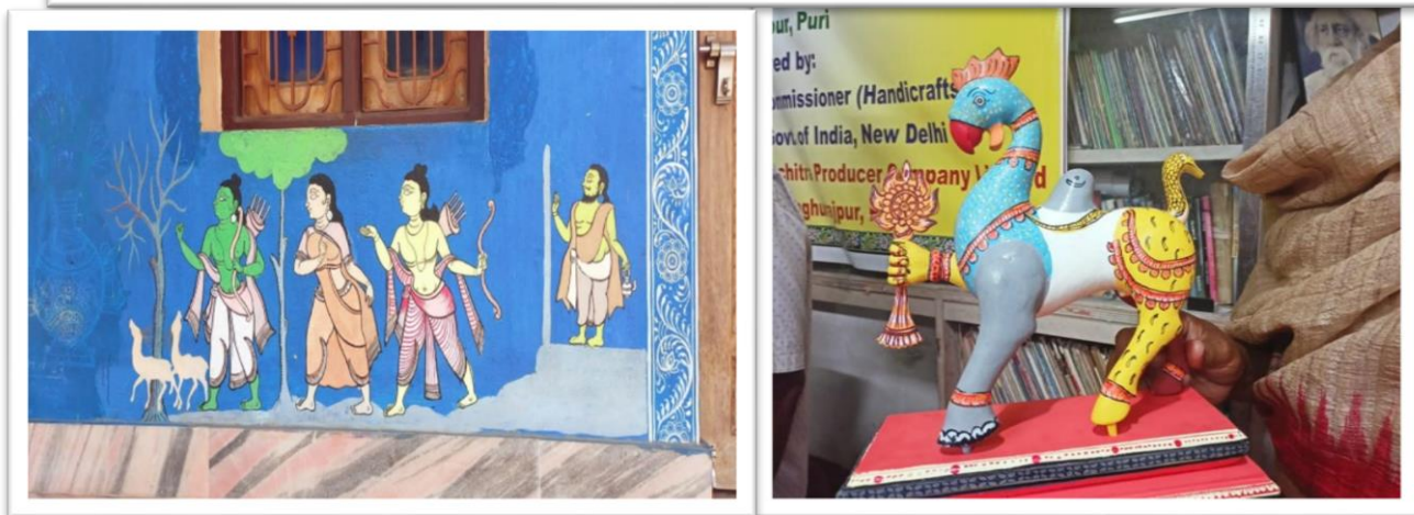
Figure 7 & 8: Rama Devi Women's University, Department of Gender Studies organized an exposure visit to Raghurajpur, Odisha on 15th March 2022. Raghurajpur is a heritage crafts village of Puri district, 52 kilometers away from Bhubaneswar. It is known for its master painters of Pattachitra, an art form which dates back to 5 BC in the region and Gotipua dance troupes, the precursors to the Indian classical dance form of Odissi.

All the faculties and most of the students from the Department of Gender Studies and Department of Sociology went for this exposure visit. We left for the trip around 9 am and reached the