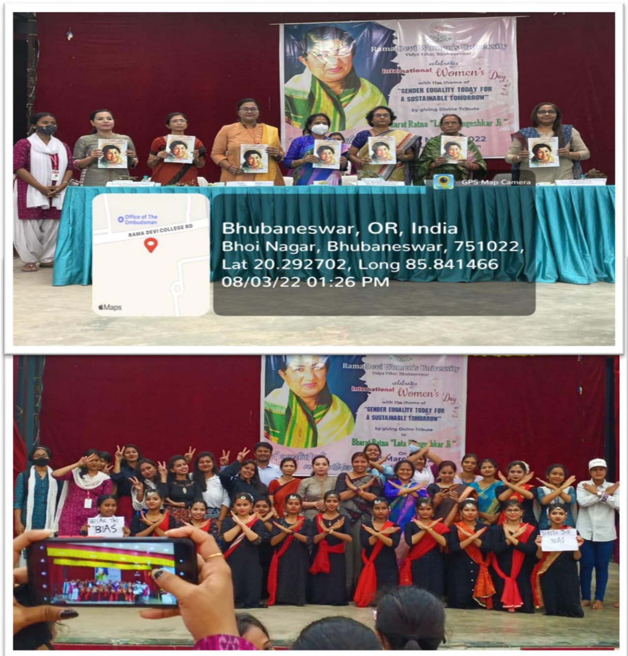
Figure 4 & 5: 8 th March 2022 International Women’s Day was organized by the P.G Department of Gender Studies with the Theme ‘Gender Equality Today for Sustainable Tomorrow’, in the university auditorium. Many of the students of the Dept. of Gender Studies participated in dance performance. The Department unveiled the Magazine Samatva by eminent guests & faculty members.