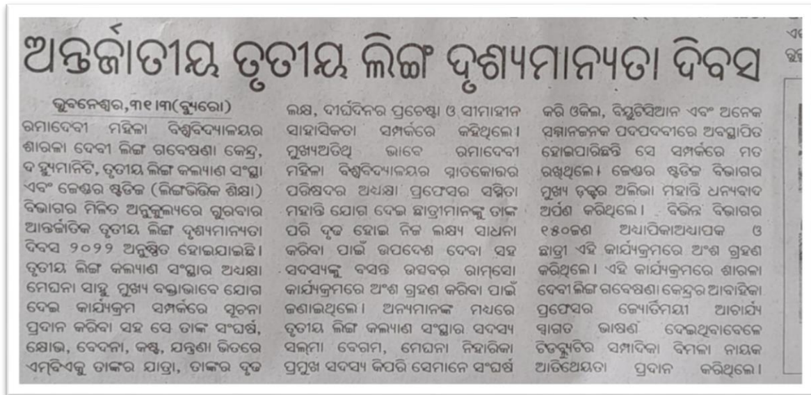
Figure 13: News Clipping on the celebration of International Transgender Day of Visibility at Academic Building 2, room no 222 held on 31.03.2022 by the Department of Gender Studies