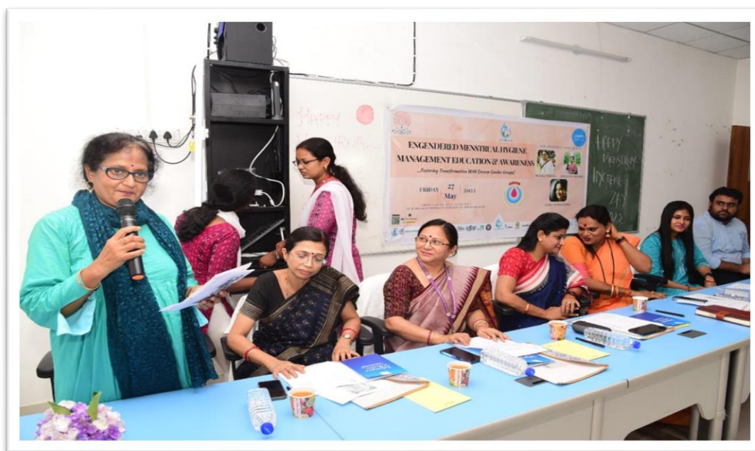
Figure 15: Each year on May 28, billions of people across the globe join together to raise awareness about Menstrual Hygiene Management. This global event is known as Menstrual Hygiene Day. The theme for 2022 is ‘#WeAreCommitted’- Making menstruation a normal fact of life by 2030.