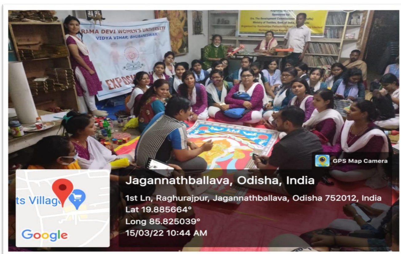
Figures 9: In the exposure visit to Raghurajpur, Odisha on 15th March 2022 students attended workshop with the master Pattachitra Painter Training Centre Sanskara and learned how the NGO is assisting the Bhubaneswar museum to preserve the old pothi engraved in Palm leaves.

destination at around 10:45 am. As soon as we entered the village along with my friends and teachers, it felt like we'd stepped into a whole other world. It wouldn't be wrong to say that the entire village is truly a representative of art. It reflects the richness of Odisha's art and culture. Every house there contains a bunch of artists: from a 10-year-old to a 60-year-old. The walls of every house seem to echo the ancient Vedic stories as well as the stories of a common household. We also visited an NGO named "PARAMPARA" wherein both men and women are taught to do a variety of Pattachitra paintings on household articles such as lanterns, small buckets etc. They sell those artworks further and earn enough to sustain their living. The guide of the NGO gave us a brief idea about how they work. The shine in their eyes while talking with them showed how passionate they were about our art and culture. Whoever says that art cannot sustain life would be proved wrong once they visit the village and meet the people there. Then, we went to several houses to take a look at the artworks and truly, wherever we went there was more and more to be amused.