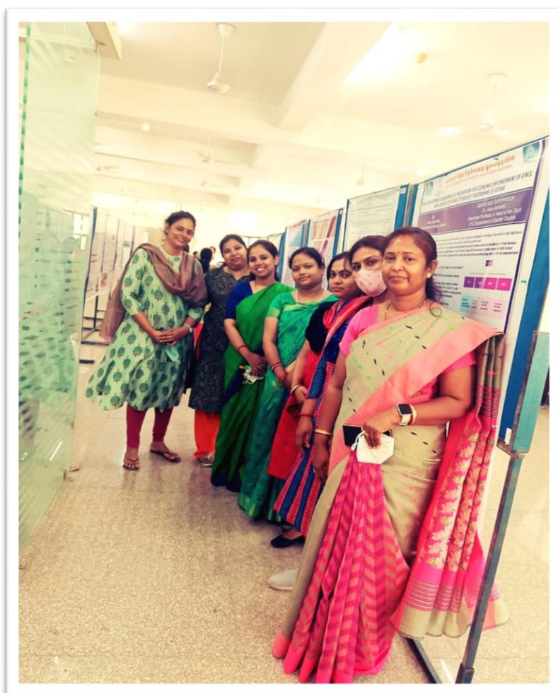
Figure 6: On 9 th March the inaugural session of the “Research Scholar” Conclave was organized in the auditorium. Posters related to the topics were presented at the Kuntala Kumari Library. Research Scholars from various departments participated.