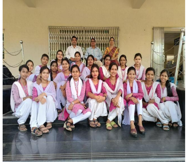
Group Photos with Internal & External Examiners